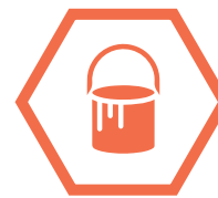
PAINTS & SPECIALTY COATINGS