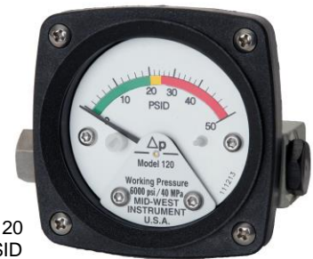
Model 120 0-50 PSID With Special 3 Color Dial

An optional maximum indication follower pointer provides automatic indication of maximum differential occurring during a time period or system cycle. Reversed pressure ports are optionally available to facilitate installation and readability depending on which side of a filter, etc., the instrument must be installed.