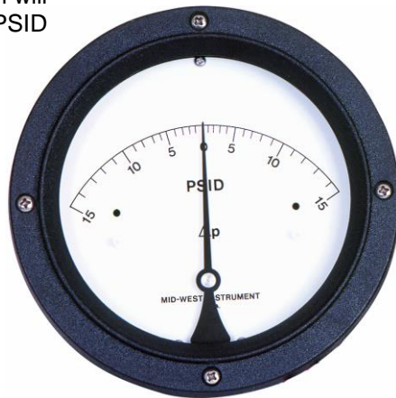
Model 120 15-0-15 PSID 4-1/2" Dial Bi-Directional

Due to precision sizing of piston and body bore, leakage across piston will not exceed 32 SCFH air at 100 PSID at ambient temperature.