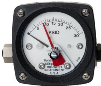
Model 120 0-30 PSID With Maximum Follower Pointer