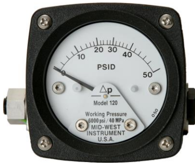
Model 120 0-50 PSID 2-1/2" Dial

A low-cost differential pressure gauge for use in measuring the pressure drop across filters, strainers, separators, valves, pumps, chillers, etc., and for local flow indication and control.