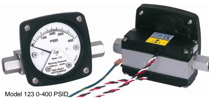
Shown with 2 Std. Switches