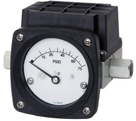
Model 124 0-75 PSID Shown with End Connections & Transmitter

A low cost differential pressure gauge for use in measuring the pressure drop across filters, strainers, separators, valves, pumps, chillers, etc., and for local flow indication and control.