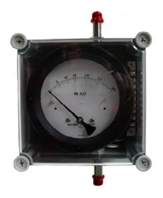
Shown in NEMA 4X Plastic enclosures

Factory preset switch at no extra charge (Specify Setting) Specify increasing or decreasing range to be set.