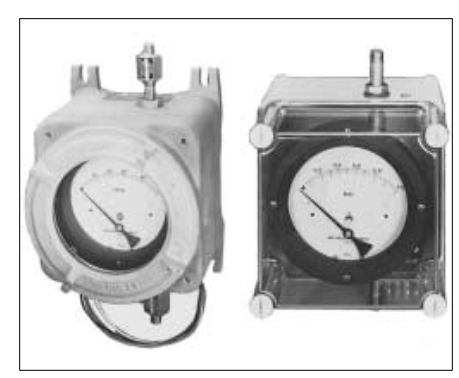
Model 130 in Explosion Proof (left) and NEMA 4X (right) enclosures