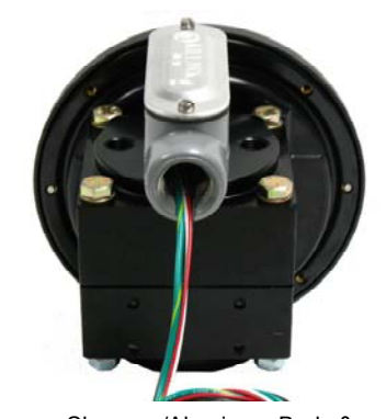
Shown w/Aluminum Body & (1) Reed Switch in Condulet enclosure

Model 130 is available in Aluminum, Brass and 316SS bodies only with one or two hermetically sealed reed switches for low and/or high limit alarm. These CSA listed switches are Single Pole Double Throw (SPDT) with adjustable set points. Switches can be set to activate/deactivate on rising or falling pressure. Switches are enclosed in a weather resistant housing. Switch setting is readily made with a screw adjustment.